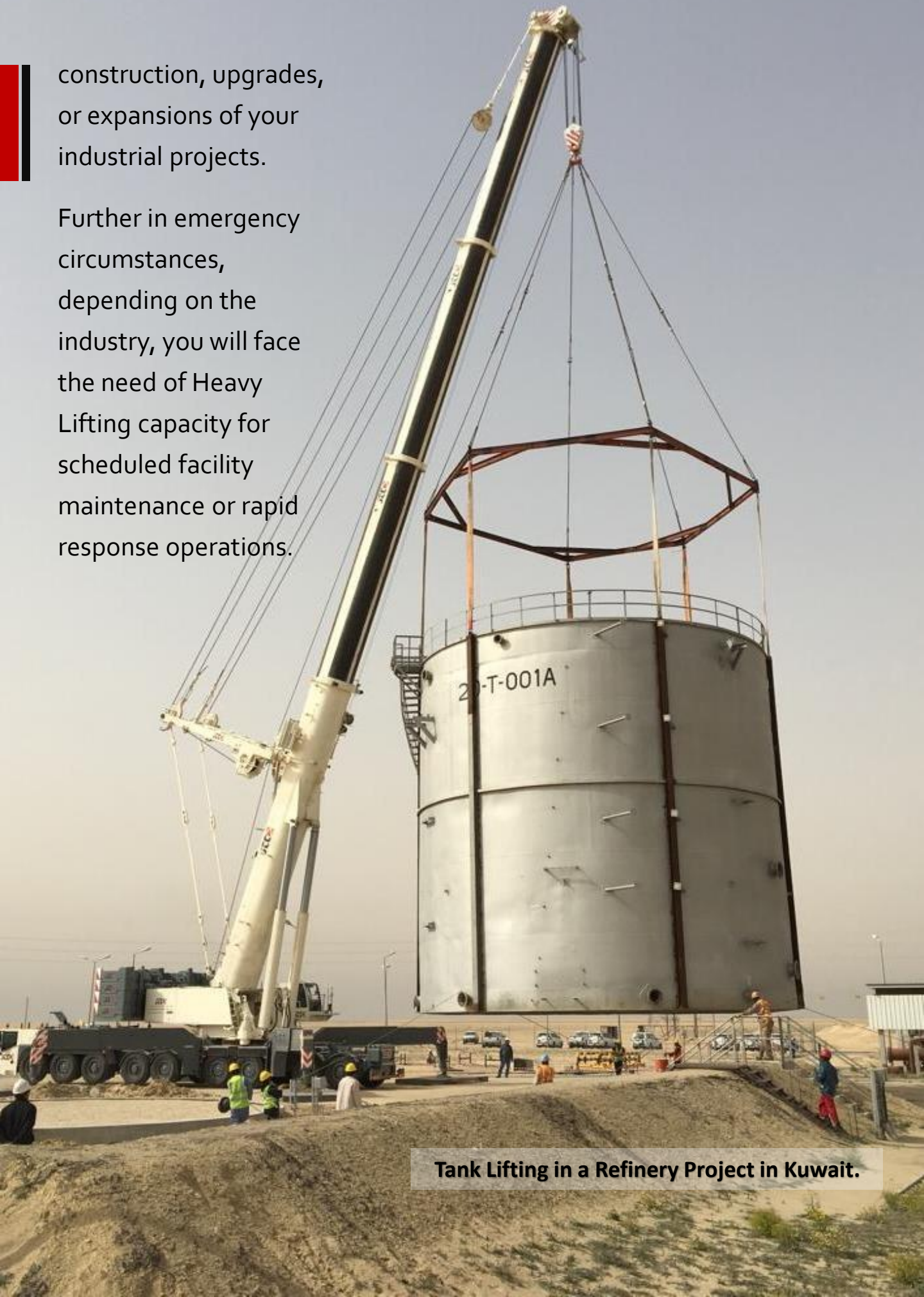
Tank Lifting in a Refinery Project in Kuwait.

Further in emergency circumstances, depending on the industry, you will face the need of Heavy Lifting capacity for scheduled facility maintenance or rapid response operations.