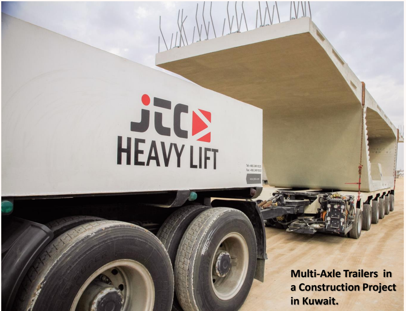
Multi-Axle Trailers in a Construction Project in Kuwait.